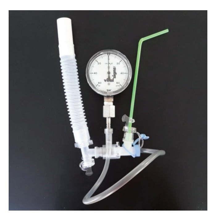
Figure 1. Experimental 'temporary' device used for conducting the study

straws of 4, 5 and 6 mm diameter, according to one of the following exhalation instructions. Instruction A: 'Please exhale continuously so that you feel low resistance during exhalation'; or Instruction B: 'Please exhale continuously so that you feel moderate resistance during exhalation', without any further clarification. The participant was asked to exhale into the device 3 times according to one of the two instructions. This procedure was repeated for each tested straw diameter. Instruction switching was applied for each new participant to ensure randomization between instructions, whereas a rotation algorithm was used for randomization between the straws of different diameter. A rest time of 30 s was given between each straw change or each instruction switching.